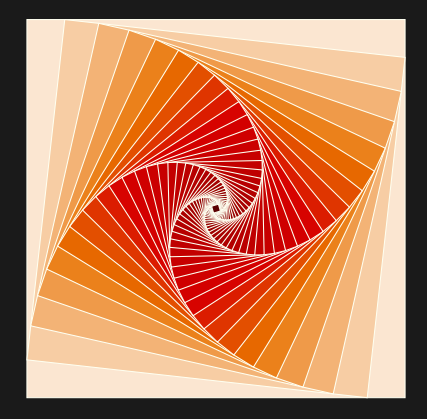
Figure 1: Rotated square with Tikz package from texample.net.